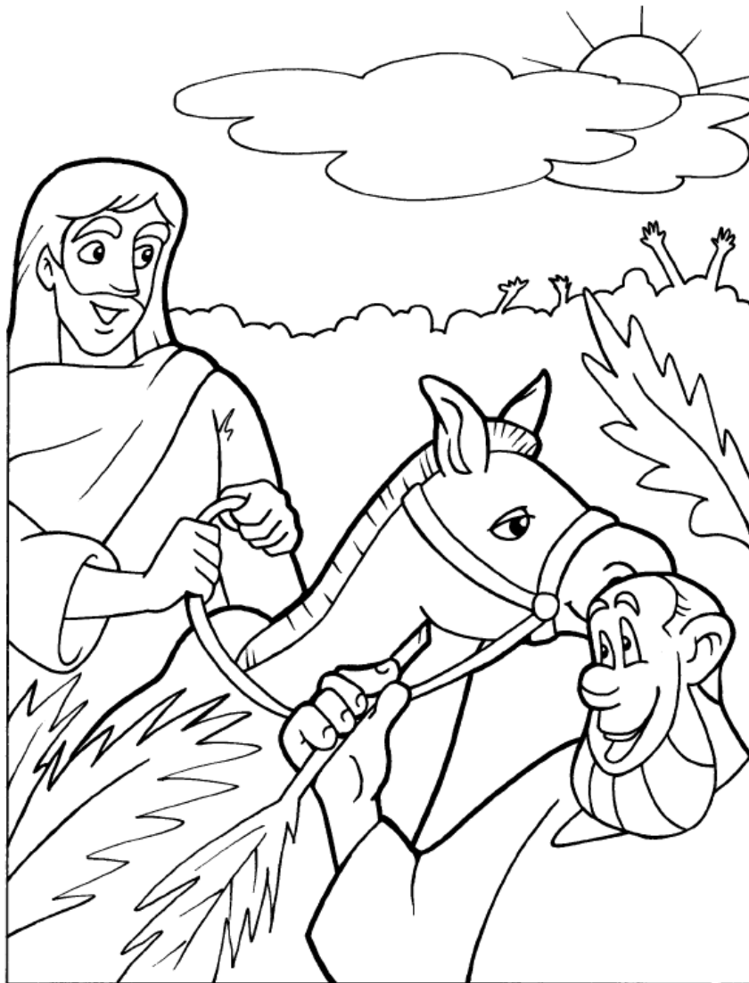
The Triumphal Entry

Each number represents a letter of the alphabet. Substitute the correct letter for the numbers to reveal the coded words.